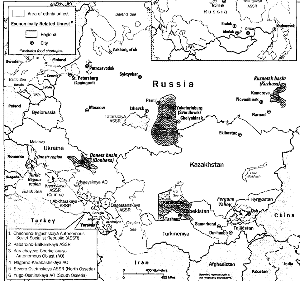
Figure 1 Potential Areas of Unrest in the Former Soviet Union