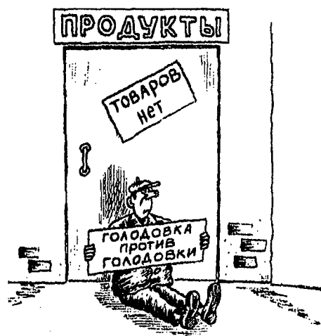
Рис. Н. КИЩАРОВА.

Consumers. Consumers are long accustomed to scarce and shoddy goods, but food and fuel shortages combined with skyrocketing prices of many essential goods could finally push them over the edge. Like the unemployed, consumers lack organization. Moreover, those who will suffer the most economic pain—pensioners, the disabled, and children—are least likely to engage in direct protest action. (S-NT)