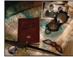
Office of Strategic Services featured on page 7

Like all Allied forces that operated behind Nazi lines, the Jedburghs were subject to torture and execution in the event of capture under Hitler's notorious Commando Order. A few weeks before the Normandy invasion, the German High Command had broadcast the following warning: "Whoever on French territory outside of the zone of legal combat is captured and identified as having participated in sabotage, terrorism, or revolt remains