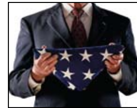
Flag featured on page 13