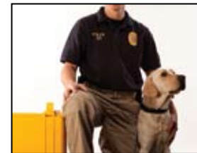
Partners featured on page 29

The K-9 teams form very strong cross-species partnerships. After dog and handler are paired, they complete the Bureau of Alcohol, Tobacco and Firearms’ rigorous 10-week training program during which human and dog learn to rely on each other and to work as a cohesive unit to locate and identify a wide variety of harmful materials. These highly