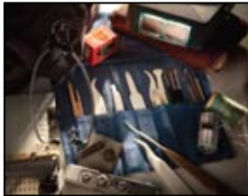
Tradecraft Tools featured on page 9