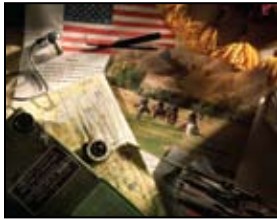
Team Alpha featured on page 23

This portrait of a CIA nurse was taken a few months before her retirement. Her final international trip for CIA was to Kabul, where she was a member of a medical clinic serving officers and locally hired people. This was her fourth trip for CIA since 9/11 to staff medical clinics in the war zones of Afghanistan and Iraq.