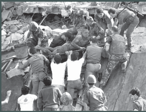
Beirut, 23 October 1983: A shirtless, dust-covered and dazed US Marine lies half-prone on a stretcher as it is lifted over the rubble of the bombed barracks by fellow Marines, British troops, and local volunteers straining to get him to safety.