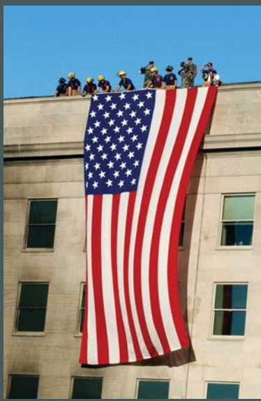
Arlington, VA, 11 September 2001: A group of military and civilian recovery workers stand at the edge of the Pentagon's roof and unfurl a large US flag near the damage inflicted in the building's side by American Airlines Flight 77.