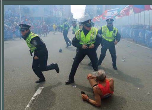
Boston, 15 April 2013: Three city police officers, having come to the aid of an elderly marathoner thrown to the ground by the first explosion, react to a second blast farther down the course.