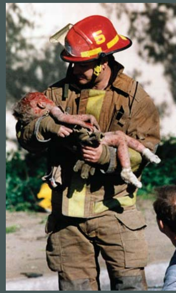
Oklahoma City, 19 April 1995: A firefighter cradles a one-year old girl pulled from the rubble of a truck bomb attack, her curls stained with blood.