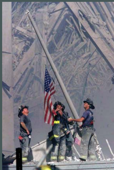
New York City, 11 September 2001: Three exhausted, grimy rescue and recovery workers in protective gear raise the US flag up a flagpole they place deep inside the pit of destroyed skyscrapers.