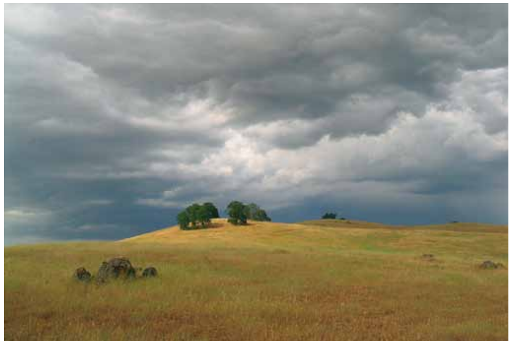
Grassland near Latrobe Road.

The U.S. Fish and Wildlife Service is the principal federal agency responsible for conserving, protecting, and enhancing fish, wildlife, plants and their habitats for the continuing benefit of the American people. The Service manages the 150-million acre National Wildlife Refuge System, which encompasses more than 553 refuges, thousands of small wetlands, and other special management areas. It also operates 66 national fish hatcheries, 64 fishery resource offices, and 78 ecological services field stations. The agency enforces federal wildlife laws, administers the Endangered Species Act, manages migratory bird populations, restores nationally significant fisheries, conserves and restores wildlife habitat.