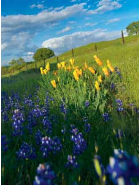
Poppies and lupin.