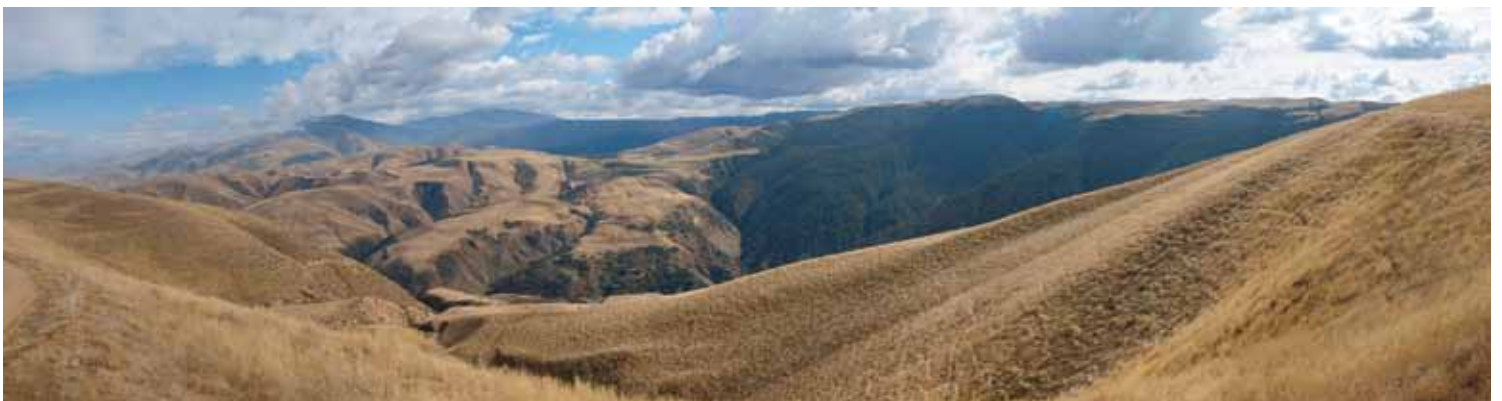
Foothill rangelands.

If established, the CFLA project boundary would define an area where the Service has internal approval to acquire easements. It is Service policy to acquire land only from landowners who are willing sellers. Acquisitions are subject to funding availability.