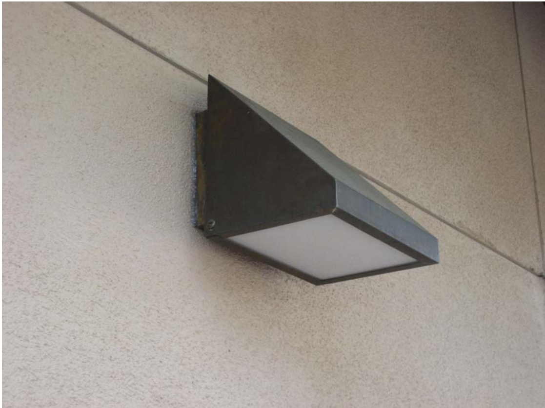
Black Community Services Center (shown here with blunt-nose option)

Contact: Melinda LaValle 925.242.0111 melinda.lavalle@cal-lighting.com