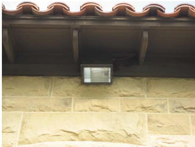
Memorial Court Arcade Eave, Main Quad