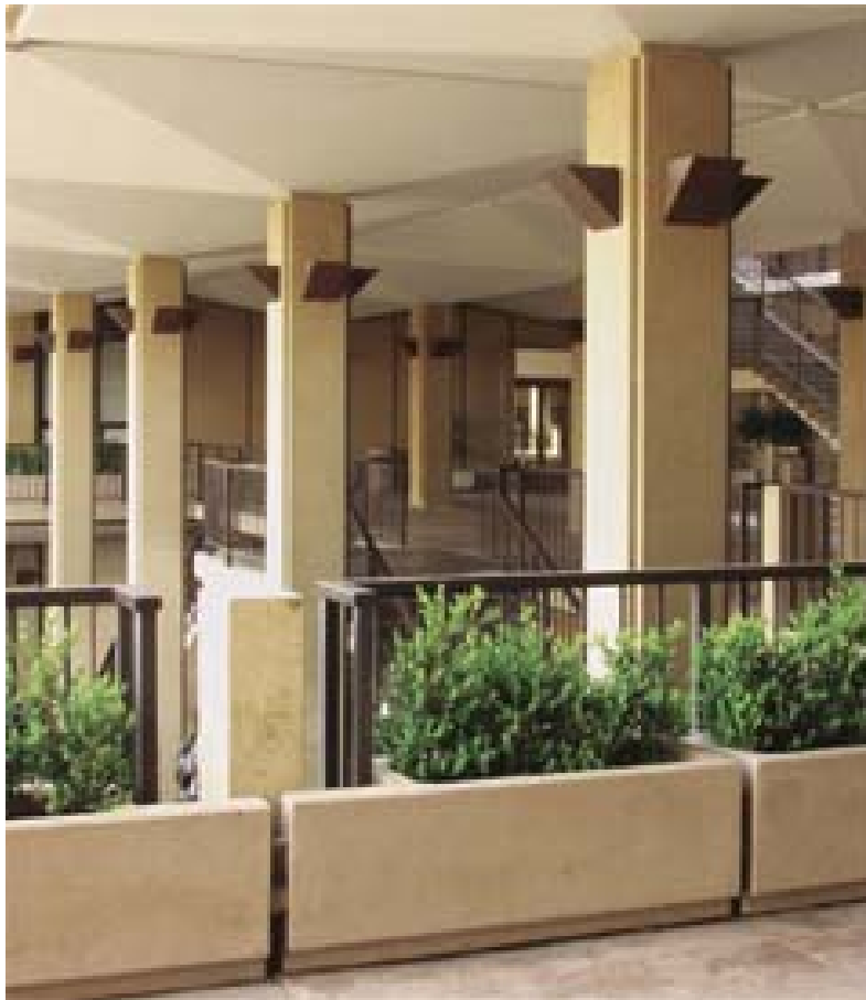
Graduate School of Business