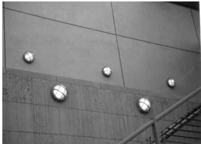
Sequoia Hall, Stanford Campus