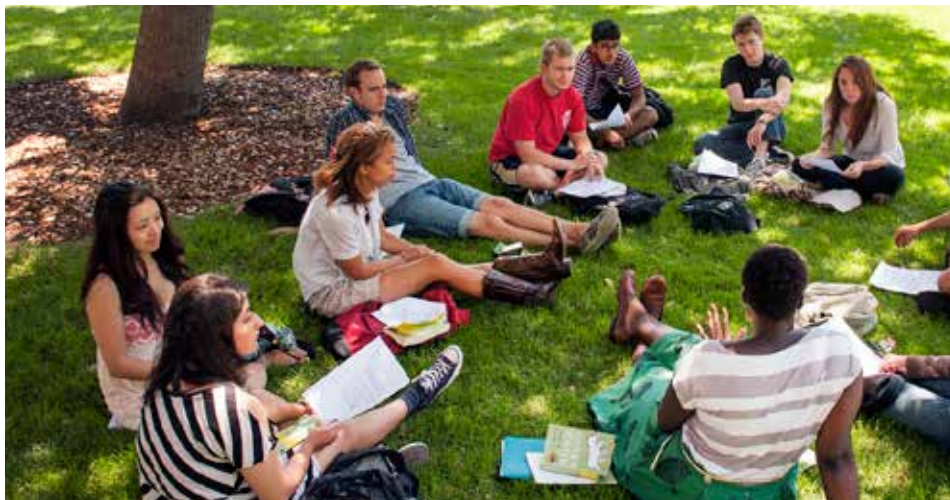
Stanford enrolls about 7,000 undergraduate students.

Most gifts made to the university are under $1,000. Together, these gifts add up to millions of dollars that can be used for need-based financial aid, academic programs, solutions-oriented research into global problems, and programs such as the Haas Center for Public Service.