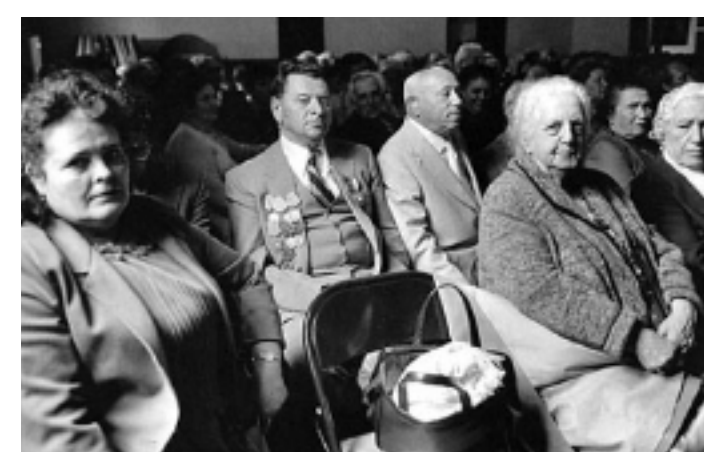
"Strategizing" from the series Soviet Jews in San Francisco.

n 2002, the Stanford University Libraries acquired 15,000 negatives, 1,200 study prints, and over 600 archival prints from three extensive series of photographs taken by Ira Nowinski, mainly during the midand late 1980s: