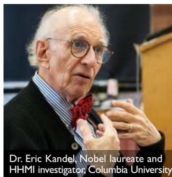
Dr. Eric Kandel, Nobel laureate and HHMI investigator, Columbia University

SHARE YOUR RESEARCH and network with other trainees and renowned physician-scientists at the Scientific Meeting of Medical Fellows at the ASCI-AAP Joint Meeting in Chicago.