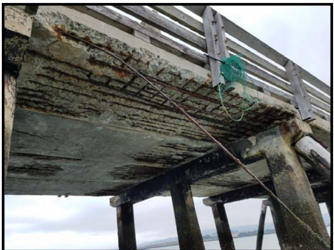
Inspection Photo of the Existing Pier Structure