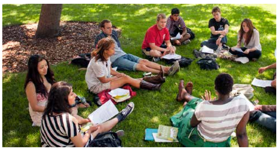
Stanford enrolls about 7,000 undergraduate students.

Most gifts made to the university are under $1,000. Together, these gifts add up to millions of dollars that can be used for need-based financial aid, academic programs, solutions-oriented research into global problems, and programs such as the Haas Center for Public Service.