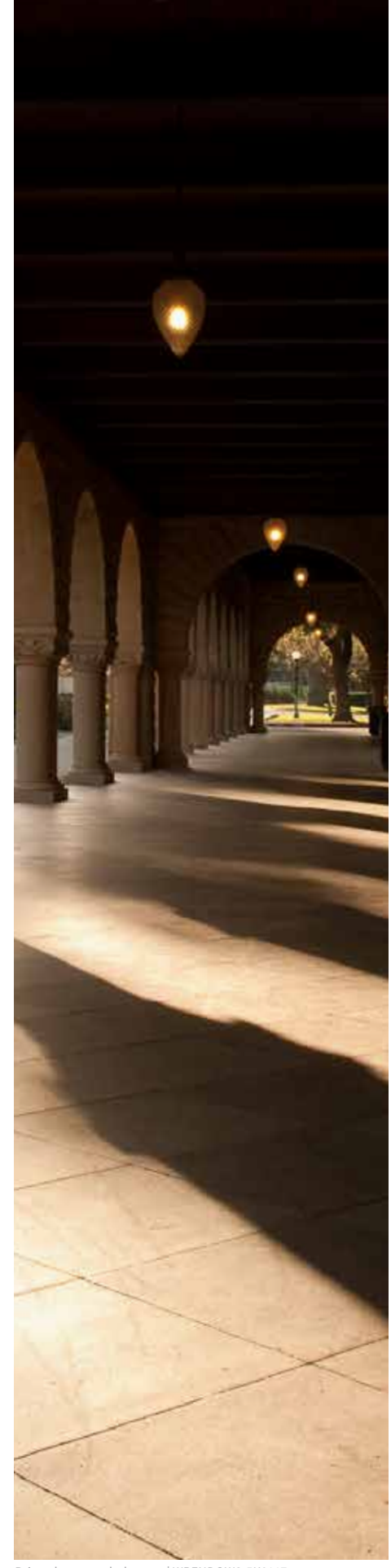
Printed on recycled paper | WPENDOW3.5K0117

giving.to.stanford@stanford.edu giving.stanford.edu