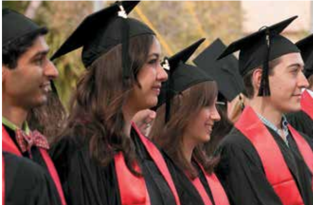
Tuition covers only about two-thirds of the real costs of a Stanford underaraduate education.

year. What's more, tuition covers only about two-thirds of the real costs associated with a Stanford undergraduate education. Thus, even those paying "full price" are not actually paying the full cost of four years at Stanford. From the university's first days, a Stanford education has been subsidized by the generosity of the founders, alumni, parents, friends, and other donors. Today, nearly half of all Stanford undergraduates receive need-based aid directly from the university.