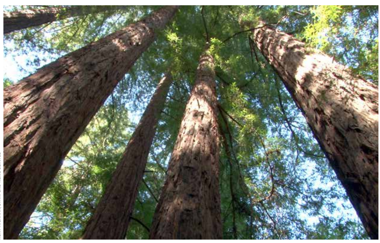
The university's Jasper Ridge Biological Preserve supports an average of 60 research projects each year.

Keeping the land intact has allowed the university to retain one of the country's most magnificent campuses, which is a strong magnet for potential students, faculty, and researchers. Even the undeveloped land serves important academic purposes. For instance, the Jasper Ridge Biological Preserve covers 1,189 acres of the campus and has been the site of many fundamental studies in ecology, hydrology, geology, and archaeology.