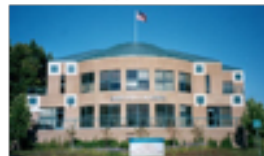
Pleasanton Feb 2016