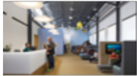
Emeryville Oct 2013