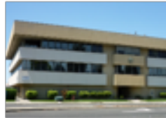
Fremont March 2016