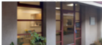
Capitola Dec 2013