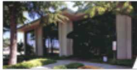
Los Gatos Aug 2015