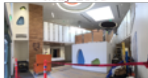
Sunnyvale May 2016