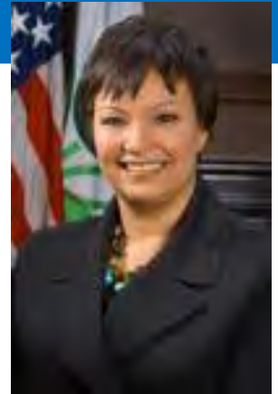
Lisa P. Jackson Administrator U.S. Environmental Protection Agency