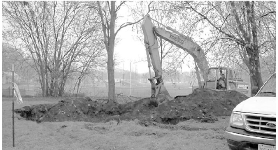
EPA excavates lead-contaminated soil at the NPL-1 area.