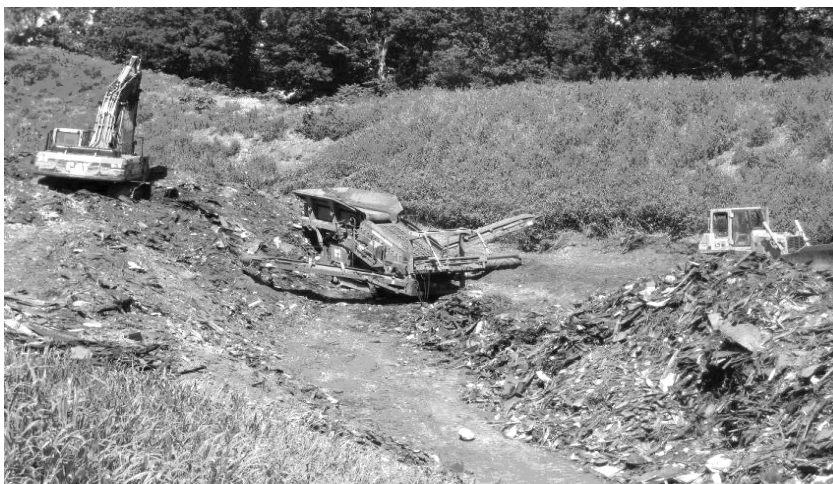
Heavy equipment loads a debris pile on a sorting machine as part of EPA's removal project at the VIM Recycling site.

During the cleanup, EPA is ensuring workers make every effort to reduce the amount of smoke and dust escaping from the location. Due to the heat within the C Pile, it is impossible to stop all emissions, but workers are spraying water on roadways to control dust and applying soil, water and foam to extinguish fires. Temperatures are constantly monitored in the waste material during excavation, loading, transport and disposal to prevent new fires. In addition, the site is being monitored regularly to catch and put out any fires that may arise during nights and weekends.