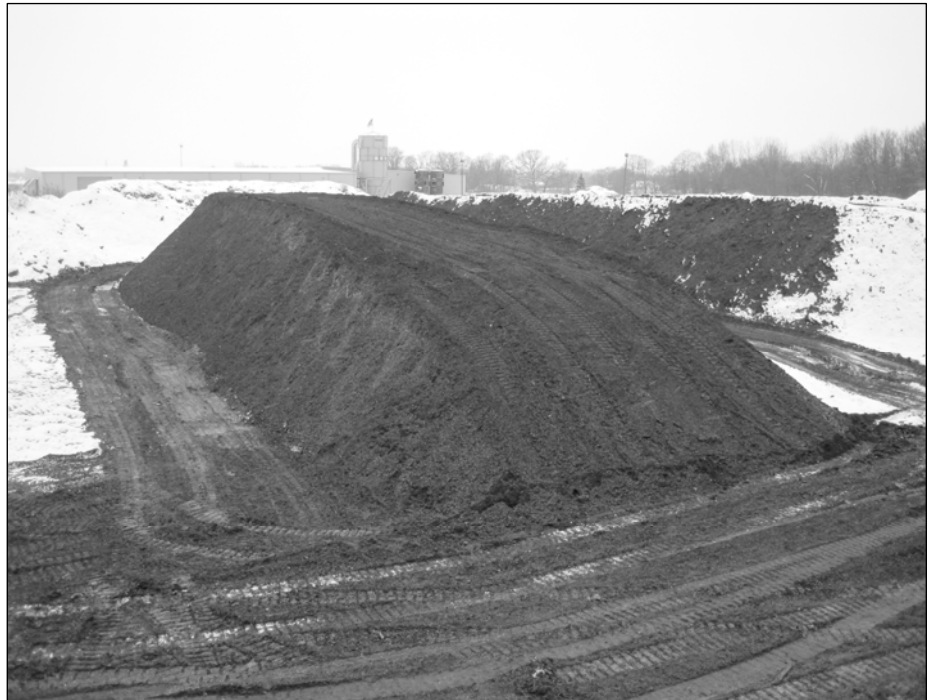
A long pile, or windrow, of small wood pieces and soil remaining on the VIM Recycling site resulting from the C Pile removal. This material will be blended and sold as a soil product.

The large pieces of wood were loaded onto more than 1,200 trucks and sent to a nearby landfill. The remaining material, which resembles topsoil, was left on-site in four long piles called windrows. This material will be composted and blended into a soil product that will be manufactured at the site by a third party and sold under a marketing and distribution permit issued by Indiana Department of Environmental Management.