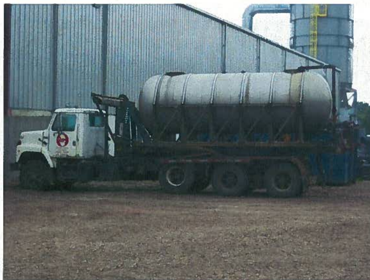
Photo 4. VIM Recycling, Elkhart, Indiana. Description: Water truck utilized for dust control on roadways and fire suppression if necessary Date Taken: 7/2/09