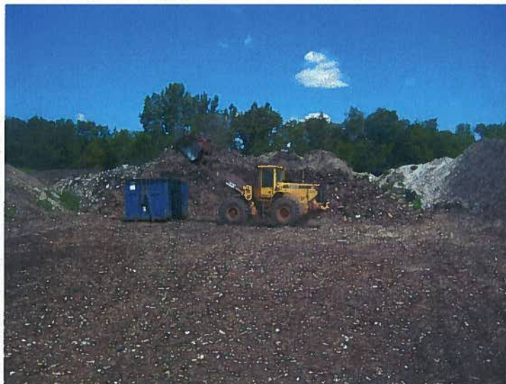
Photo 3. VIM Recycling, Elkhart, Indiana. Description: Equipment dedicated to "O-1" stockpile excavation and removal Date Taken: 7/13/09