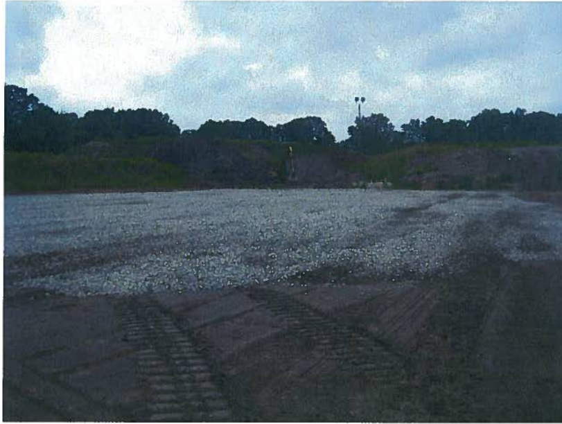
Photo 1. VIM Recycling, Inc., Elkhart, Indiana.

Description: Gravel pad established at SW corner of "C Pile" for access, staging, vehicle turn-around Date Taken: 7/12/09