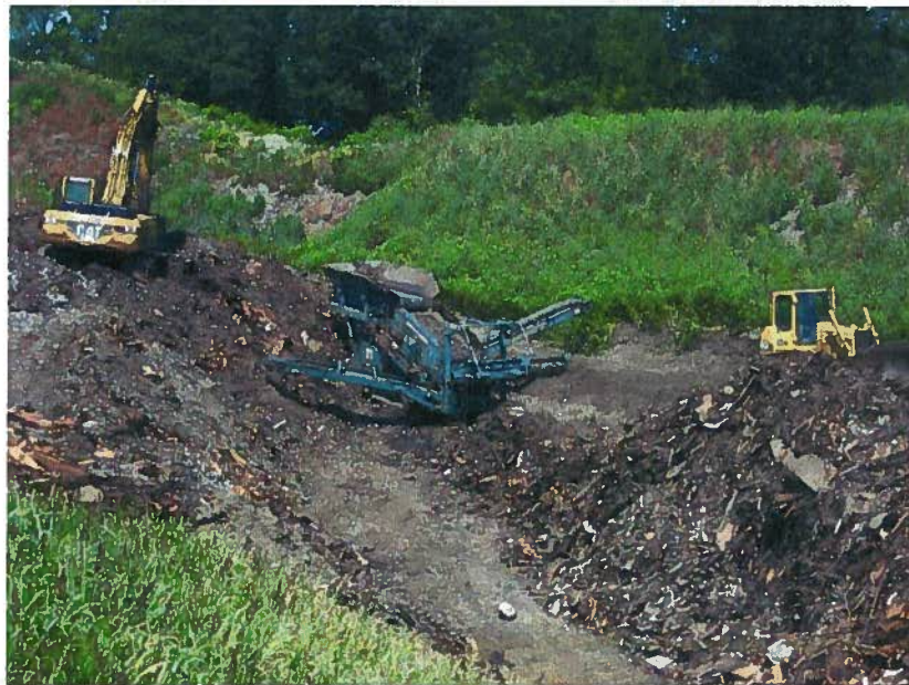
Photo 2. VIM Recycling, Elkhart Indiana.

Description: Gravel pad established at SW corner of "C Pile" for access, staging, vehicle turn-around Date Taken: 7/12/09