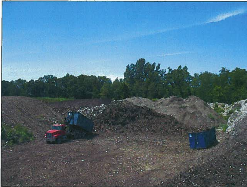
Photo 1. VIM Recycling, Inc., Elkhart operations Description: Removal of O-1 pile into 50 yd roll-off containers Date Taken: 7/16/09