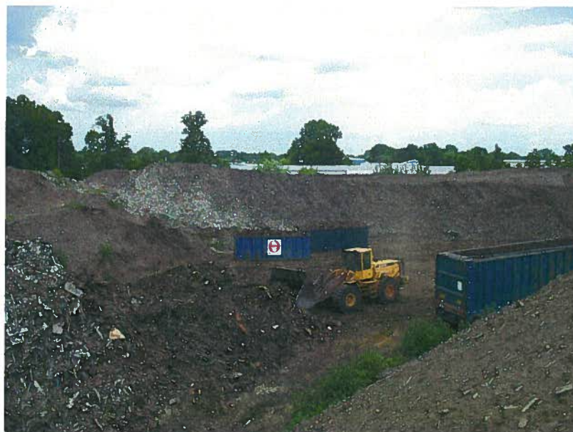
Photo 2. VIM Recycling, Elkhart operations Description: L-120D loader excavating and loading out O-1 pile into 50 yd and 100 yd trailers Date Taken: 7/21/09