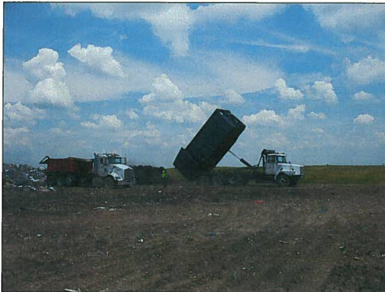
Photo 3. Elkhart County Landfill, Elkhart, Indiana Description: Disposal of overs (> 4" particles) from 50 yd container at landfill Date Taken: 7/21/09