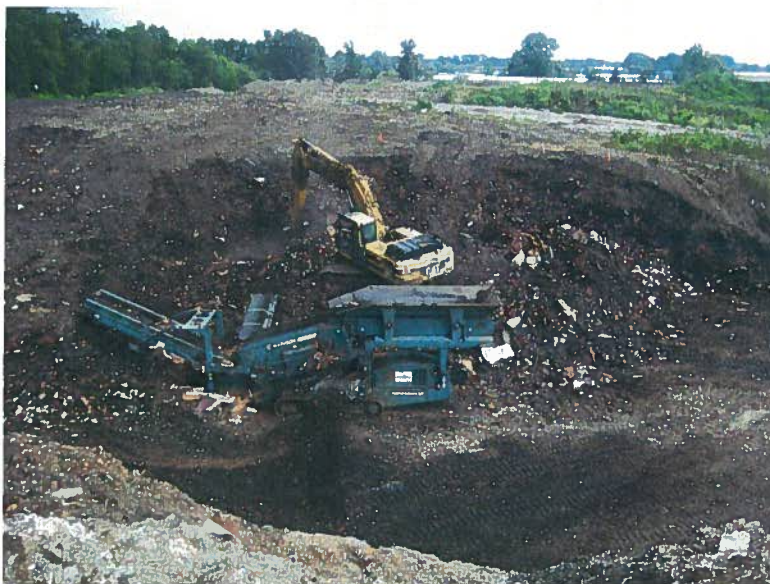
Photo 4. VIM Recycling, Elkhart operations Description: Excavation and screening activity on west side of C-pile Date Taken: 7/28/09