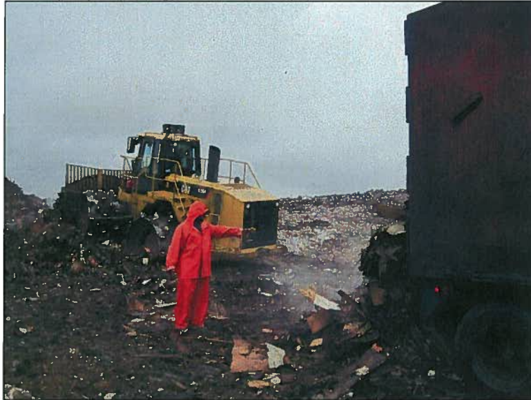
Photo 3. Elkhart County Landfill, Elkhart

Description: Landfill personnel monitoring temperature of incoming load of overs