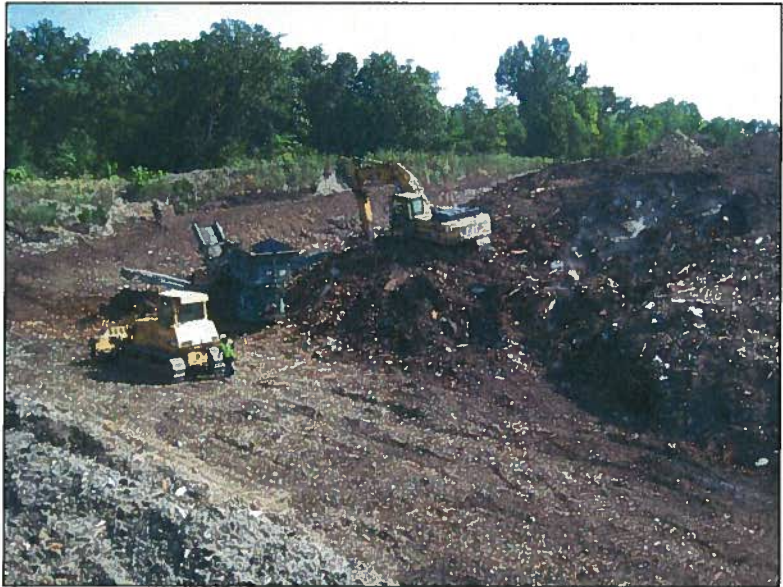
Photo 1. VIM Recycling, Inc., Elkhart operations Description: Excavation, sorting, screening operations on northwest corner of C-1 pile Date Taken: 8/13/09