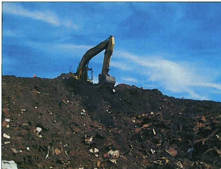
Photo 4. VIM Recycling, Elkhart operations

Description: Cat 330 excavator covering daily excavation face with topsoil to control smoke & steam