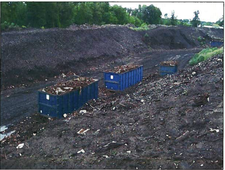
Photo 2. VIM Recycling, Elkhart operations Description: 50 yd roll-off containers filled with overs staged for removal to landfill Date Taken: 8/13/09