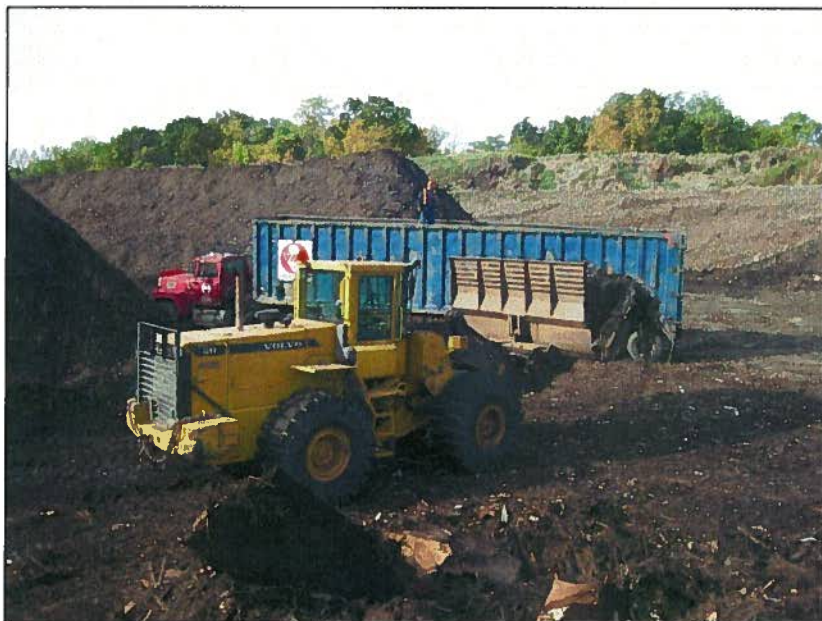
Photo 2. VIM Recycling, Elkhart operations Description: Loading out 'overs' (>4") into 100yd truck for transport to landfill Date Taken: October 18, 2009