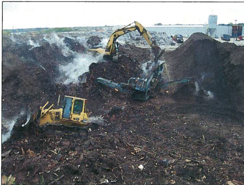
Photo 1. VIM Recycling, Inc., Elkhart operations Description: Excavation, sorting and screening operations on west side of C-1 pile Date Taken: October 18, 2009