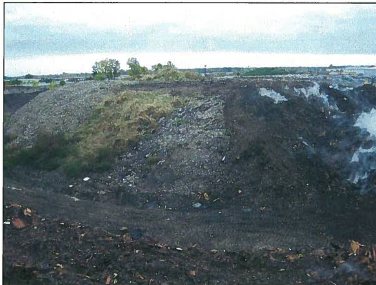
Photo 4. VIM Recycling, Elkhart operations Description: Remaining 1/3 of the C-1 pile to be excavated Date Taken: October 18, 2009