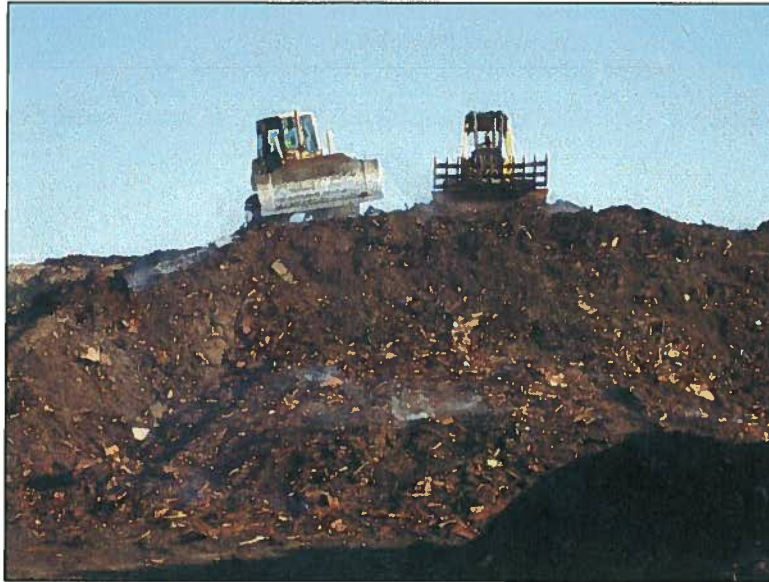
Photo 3. VIM Recycling, Elkhart operations Description: Bulldozers covering working face of excavation with soil Date Taken: October 18, 2009