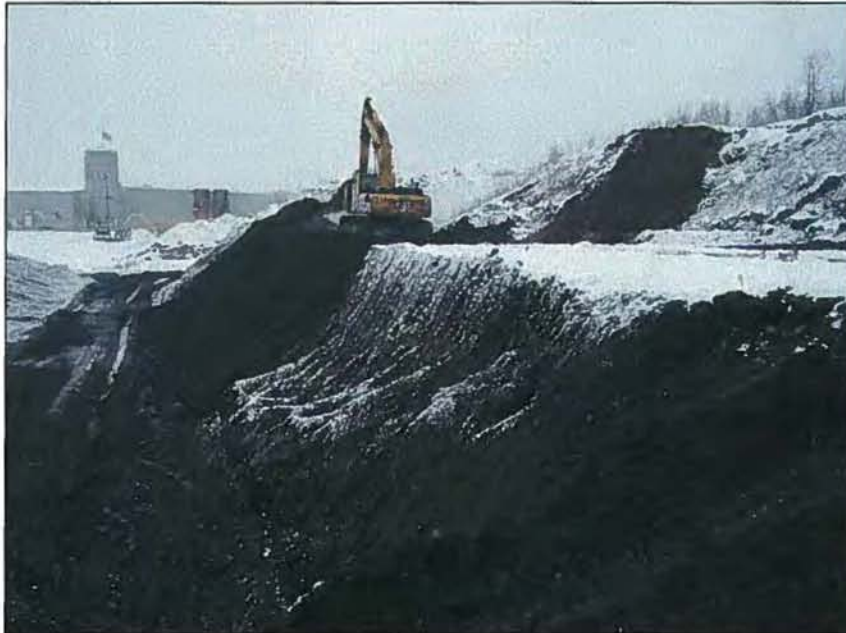
Photo 3. VIM Recycling, Elkhart operations

Description: Contouring remaining C-1 fines windrows and north/west berms