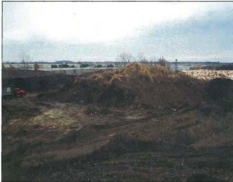
Photo 3. VIM Recycling, Elkhart operations Description: C-1 pile removal complete – remaining 'stump pile' Date Taken: December 17, 2009