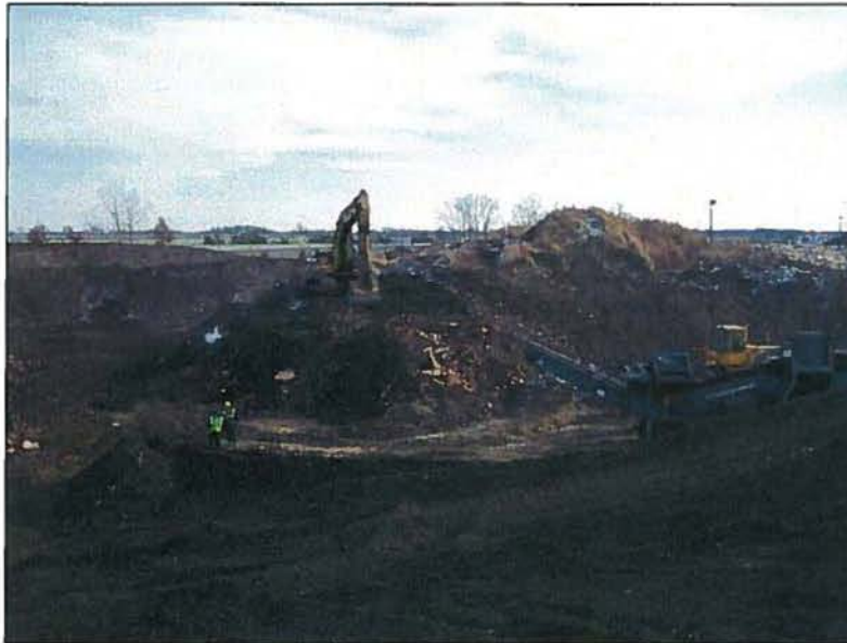
Photo 1. VIM Recycling, Inc., Elkhart operations Description: Remaining portion of C-1 pile being excavated and screened Date Taken: December 12, 2009