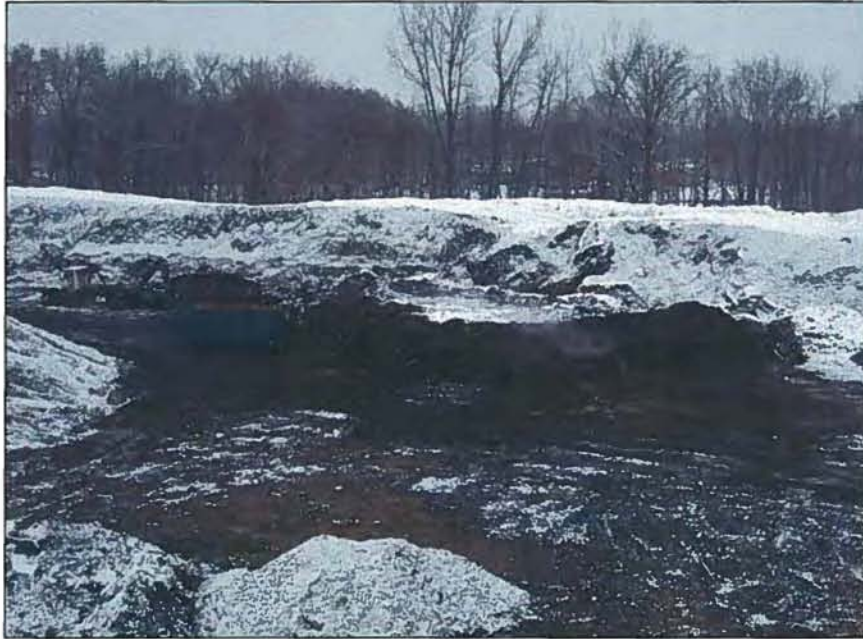
Photo 2. VIM Recycling, Elkhart operations

Description: Hauling out remaining 'overs' (> 4") in 50yd containers to landfill