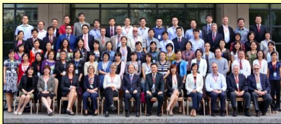
Attendees of the International Research Administration Symposium at Peking University

they will work to not only facilitate international collaborations, but also share research administration best practices with.