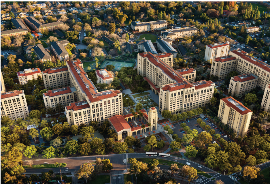
Aerial view of the Escondido Village Graduate Residences by Korth Sunseri Hagey Architects