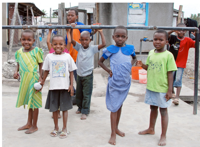
Children living in a neighborhood on the outskirts of Dar es Salaam.