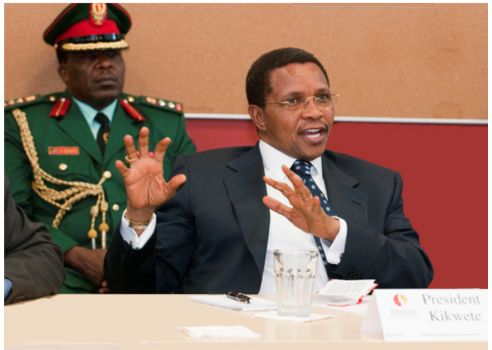
Briefing Tanzanian President Kikwete.

Our researchers separated the households into four groups. One group received only generic information about how germs are spread through the five F's - feces, flies, field, food and fingers. A second group got the generic information plus the results of their home water test. The third cohort got the generic information and their hand test results. The fourth group got everything: generic information, water test results and hand test results.