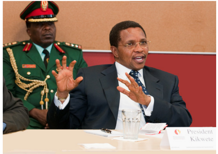
Briefing Tanzanian President Kikwete.

Our findings suggest that more information is not necessarily better. Groups that received hand data or water data alone had a more positive response than households that got both hand and water test results. In addition, for those households who were told they had good hygiene, repeat visits showed that their hygiene had actually gotten worse.