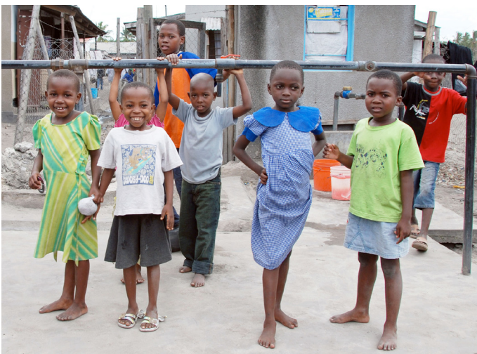
Children living in a neighborhood on the outskirts of Dar es Salaam.