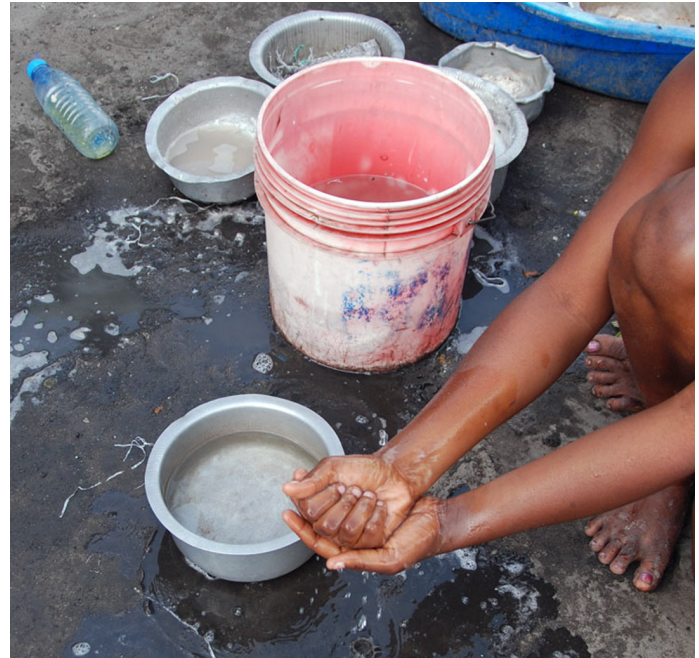
Hauling water often limits the amount available for hand washing.