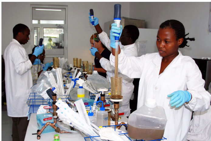
Testing samples for bacteria contamination.

Our researchers separated the households into four groups. One group received only generic information about how germs are spread through the five F's - feces, flies, field, food and fingers. A second group got the generic information plus the results of their home water test. The third cohort got the generic information and their hand test results. The fourth group got everything: generic information, water test results and hand test results.