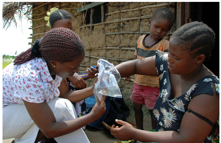
Testing hands for bacterial contamination.

In summer 2008, our team traveled to Dar es Salaam to study 335 households over a 10-week period. We hired and trained Tanzanian university students to conduct surveys and interact directly with the households. The students visited each household four times. On the first visit, they collected behavioral information and tested stored water and the hands of family members for evidence of fecal contamination. It turned out that mothers and children had very high concentrations of E. coli on their hands, as did the stored household drinking water.