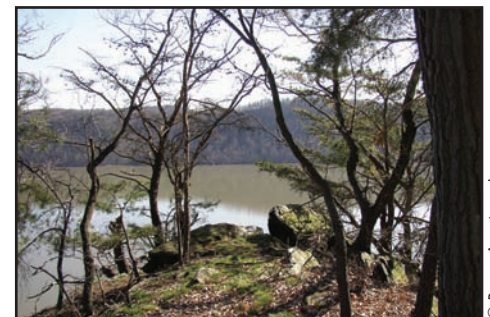
The Grace Lease Property's scenic overlook of the Susquehanna River.

The Grace Lease Property will continue to enhance Lancaster County's share of the community's most revered natural resource, the Susquehanna River. Redevelopment planning began on December 22, 2005, and to date 25.3 acres of open space has been created in Manor Township. Thus far, Lancaster County Conservancy has blazed a trail to reintegrate the property into the community by linking the small parking lot on the property as an active extension to the popular Turkey Hill hiking trail. Future amenities include creating picnic grounds and a scenic overlook of the Susquehanna River Corridor to protect and manage natural resources and wildlife habitat. Some species have already begun to see progress. The reemergence of the bald eagle symbolizes the property's strong recovery through county-wide initiatives to preserve woodlands and open space. As an untapped open space resource, the formerly desolate Grace Lease Property will soon serve as meeting grounds for migratory birds, wildlife, tourists, and nature lovers alike.