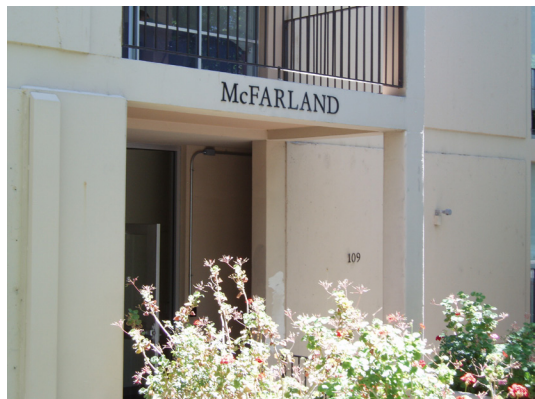
McFarland midrise will be fully sprinklered by the end of summer 2013

Stanford has made a commitment to install automatic fire sprinkler systems in graduate housing facilities. Two highrise and four midrise buildings are not fully sprinklered. Stanford plans to complete the sprinkler installation in these facilities in the future. One midrise (Abrams) was sprinklered in 2011. Currently, another midrise (McFarland) is being sprinklered.