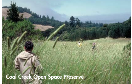
Coal Creek Open Space Preserve