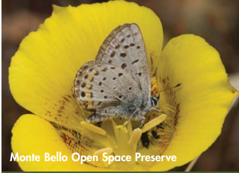
Monte Bello Open Space Preserve