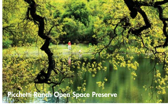
Picchetti Ranch Open Space Preserve