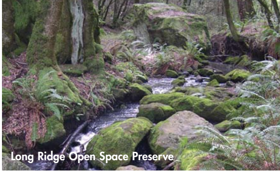
Long Ridge Open Space Preserve