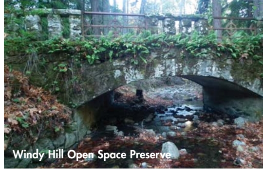
Windy Hill Open Space Preserve