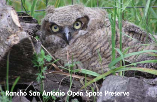
Rancho San Antonio Open Space Preserve