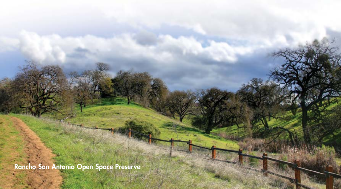
Rancho San Antonio Open Space Preserve

The District helped found the Peninsula Open Space Trust (POST) in 1977, and since then POST has been responsible for saving more than 70,000 acres as permanent open space and parkland in San Mateo, Santa Clara, and Santa Cruz counties. The two organizations have complementary strengths: as a private nonprofit organization, POST can negotiate quickly and privately with sellers, as opportunities arise, to purchase critical open space lands. The District purchases new lands, and also has the capacity to manage properties.