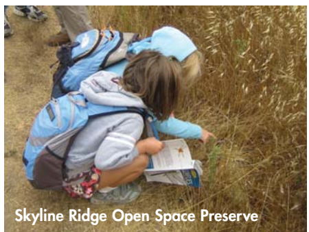
Skyline Ridge Open Space Preserve