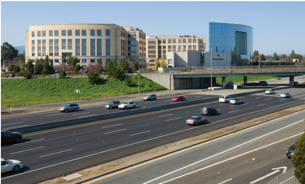
University Circle, viewed from the east side of Highway 101 in East Palo Alto, February 2013.