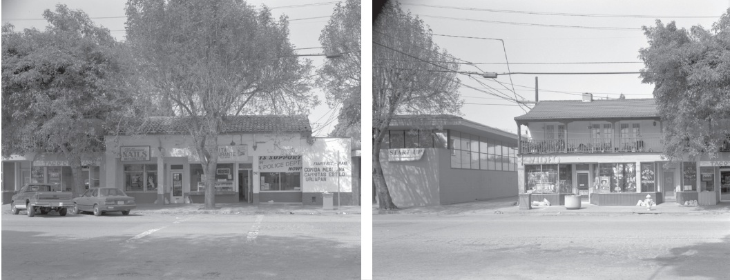
Storefronts in “Whiskey Gulch,” on University Avenue in East Palo Alto, spring 1998. The range of uses shown here includes a nonprofit, a beauty parlor, a nail salon, and several restaurants.